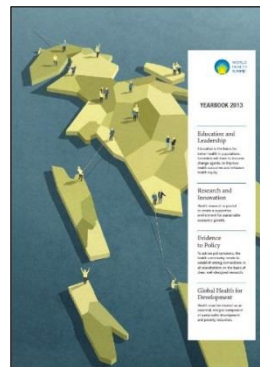
WHS Yearbook 2013 (published January 2014)

The WHS Yearbook provides substantive background information about the issues and initiatives raised at the World Health Summit and the work of world leaders in global health.