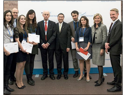
Award Winner and Hosts